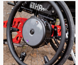
ACTIVATED POWER ASSIST