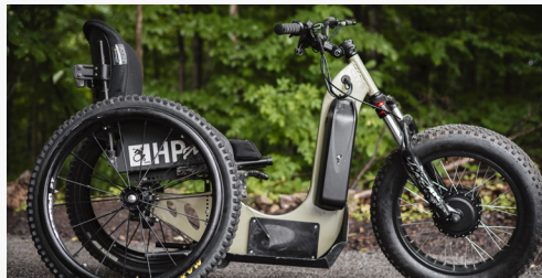
TRANSFORM YOUR WHEELCHAIR INTO A TRACKZION!